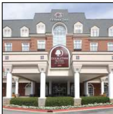
hilton.com DoubleTree Suites Lexington, Hotels Near Lexington KY