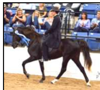
SRF's Silver Sundown Sam Tuttle & Multiple Rea Swan Award Winner Multiple Western Pleasure Grand Championship wins Registered