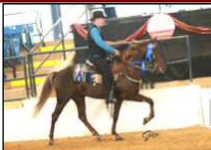
Silver's Diamond Dealer 2 time International Western Pleasure International 3 - 4 YO Stallion Conformation Winner

Nature had other plans for us last week. We had plenty of advance warning of record breaking snow. We weren't supposed to get ice but that wasn't how it turned out. The snow started (con't on p. 2) -