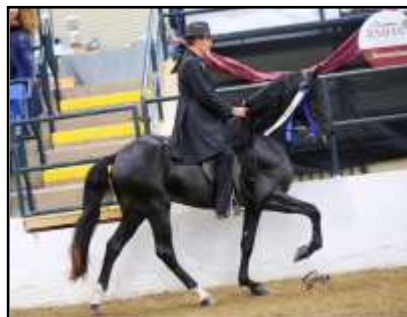
Rocky Creek Farm's Maverick RMHA International 3 YO Trail Pleasure Champion RMHA International 3 YO Reserve Show Pleasure Champion Owned by: Bobby & Julie Tucker (Future Breeding TBD)