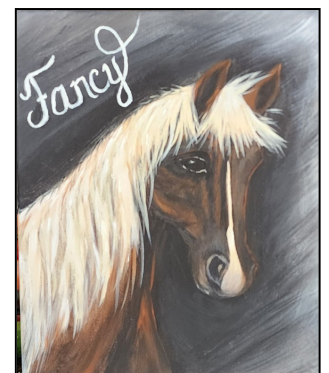
One Chance Fancy 1997 - 2025